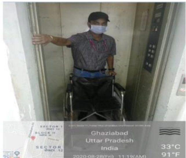
Lift Dental Building