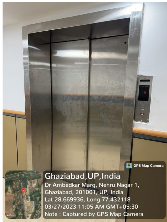
Patient Lift Hospital Building