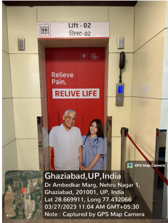
Lift Hospital Building